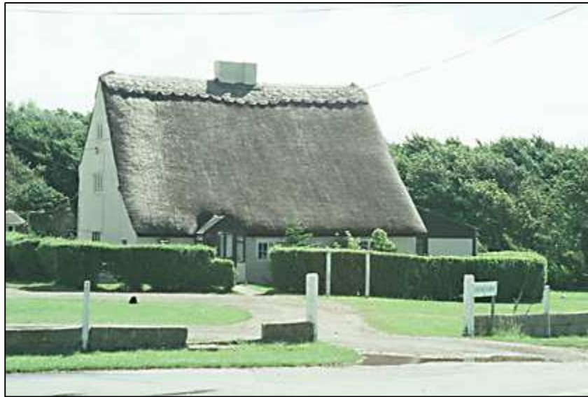
Figure 2 - Chine Farmhouse